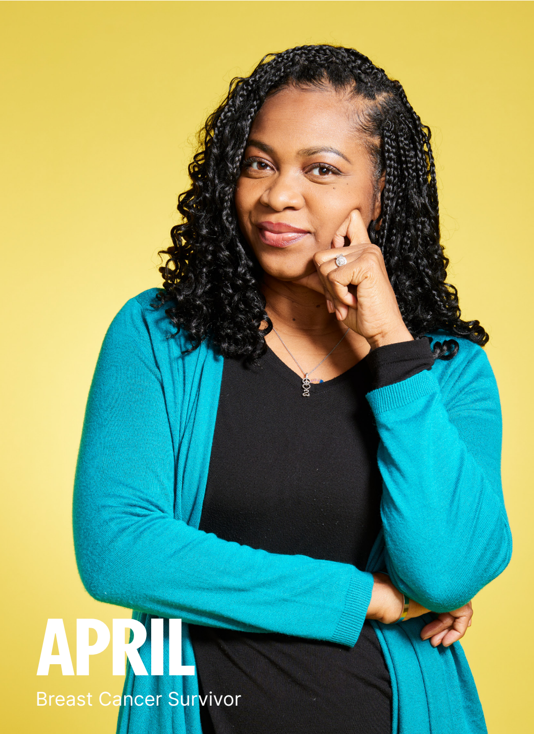
APRIL Breast Cancer Survivor